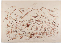
Title: Landscape Date: 1932 Primary Maker: Andrew Dasburg Medium: Ink on wove paper