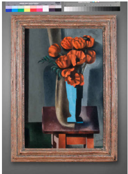
Title: Poppies Date: before 1927 Primary Maker: Andrew Dasburg Medium: oil on canvas on board