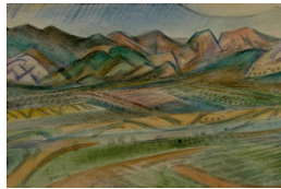
Title: Ranchos Valley Date: n.d. Primary Maker: Andrew Dasburg Medium: Watercolor