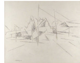
Title: Untitled (Rio Chiquito Barns) Date: 1968 Primary Maker: Andrew Dasburg Medium: ink on paper