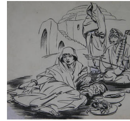
Title: Untitled Date: n.d. Primary Maker: Cyrus Baldrige Medium: ink