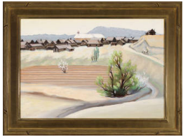
Title: Field Date: n.d. Primary Maker: Cyrus Baldrige Medium: oil on canvas