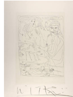
Title: Christ Teaching the Fish and Birds (from the suite Bourgeoisie in De Nile) Date: 2006 Primary Maker: Joel-Peter Witkin Medium: etching