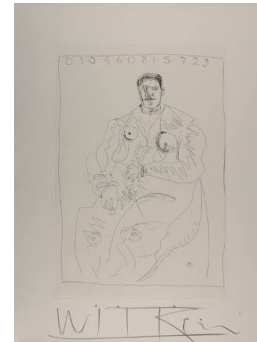
Title: I.D. Photograph: Purgatory (from the suite Bourgeoisie in De Nile) Date: 2006 Primary Maker: Joel-Peter Witkin Medium: etching