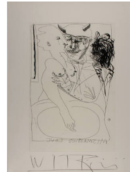
Title: Mismatched Love (from the suite Bourgeoisie in De Nile) Date: 2006 Primary Maker: Joel-Peter Witkin Medium: etching