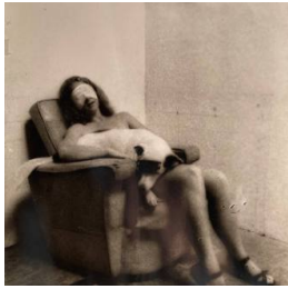
Title: Anonyme Atrocities (Seated woman with white dog) /Anonymous Atrocities Date: 1976 Primary Maker: Joel-Peter Witkin Medium: Gelatin silver print