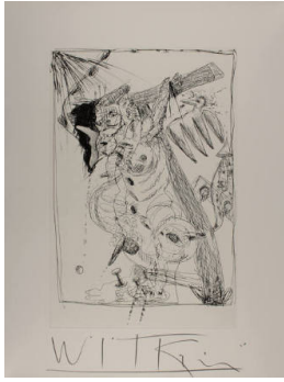
Title: Obese Man Forced to Eat Oreos (from the suite Bourgeoisie in De Nile) Date: 2006 Primary Maker: Joel-Peter Witkin Medium: etching