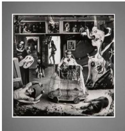
Title: Las Meninas Date: 1987 Primary Maker: Joel-Peter Witkin Medium: gelatin silver print, toned