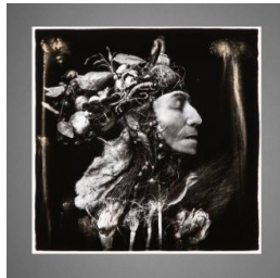
Title: Harvest, Philadelphia Date: 1984 Primary Maker: Joel-Peter Witkin Medium: toned gelatin silver photograph