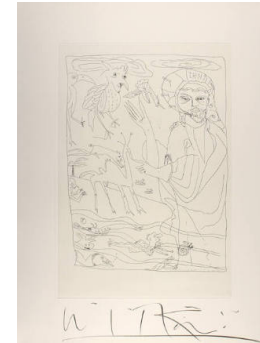
Title: Christ Teaching the Fish and Birds (from the suite Bourgeoisie in De Nile) Date: 2006 Primary Maker: Joel-Peter Witkin Medium: etching