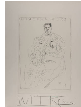
Title: I.D. Photograph: Purgatory (from the suite Bourgeoisie in De Nile) Date: 2006 Primary Maker: Joel-Peter Witkin Medium: etching