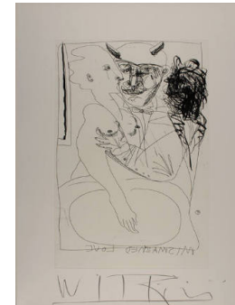
Title: Mismatched Love (from the suite Bourgeoisie in De Nile) Date: 2006 Primary Maker: Joel-Peter Witkin Medium: etching