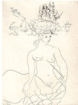
Title: Beauty Has Three Nipples Date: 1999 Primary Maker: Joel-Peter Witkin Medium: Color-line etching