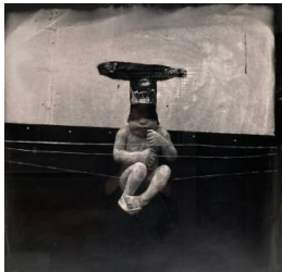
Title: Counting Lessons in Purgatory Date: 1982 Primary Maker: Joel-Peter Witkin Medium: Gelatin silver print