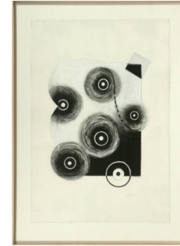
Title: No title Date: 1988 Primary Maker: Lucy Maki Medium: paint, charcoal and collage on paper