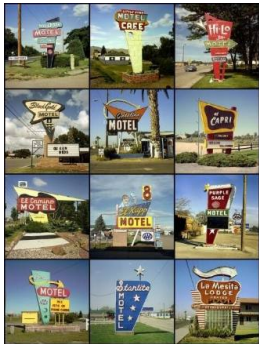
Title: Motel signs, 1979 to 2005 Date: Conceived in 2009 from negatives from 1979 through 2005, print 2021 Primary Maker: Steve Fitch Medium: Pigment print