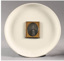
Title: Untitled (plate) Date: 1994 Primary Maker: Thomas Barrow Medium: ceramic, silver-plated copper plate, gilt brass, glass