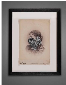
Title: For-Get-Me-Not Date: 2018 Primary Maker: Valerie Roybal Medium: collage on cabinet card