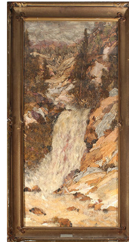
Title: Boulder Falls Date: 1936 Primary Maker: Pansy Stockton Medium: leaves, twigs, grasses and feathers on board