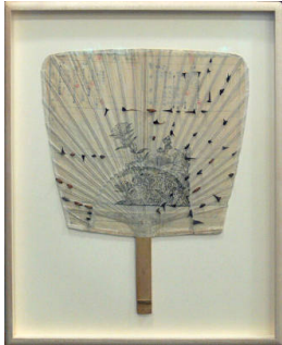
Title: Fan I Date: 2008 Primary Maker: Dana Newmann Medium: Japanese fan (paper, bamboo), black locust thorns from trees on East Palace Avenue, collaged paper from Japanese woodblock picture books