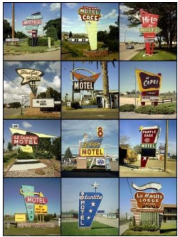
Title: Motel signs, 1979 to 2005 Date: Conceived in 2009 from negatives from 1979 through 2005, print 2021 Primary Maker: Steve Fitch Medium: Pigment print