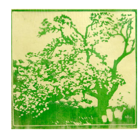
Title: Spring Blossoms (Transfer Drawing)