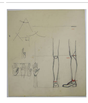
Title: Marionette Figure Studies

Date: circa 1930 - 1940 Primary Maker: Gustave