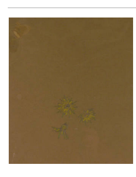
Title: Untitled Date: n.d.