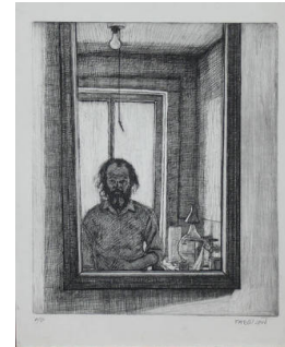
Title: Untitled Self-Portrait Date: late 20th Century Primary Maker: Donald Fabricant Medium: etching