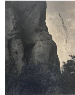
Title: Garden of the Gods, Colorado Springs, Colorado | Hexagram #22 - Pi / Grace (From the series "Images In The Heavens, Patterns On The Earth; The I Ching") Date: 1994 Primary Maker: David Scheinbaum Medium: a.) gelatin silver print with b.) printed text panel