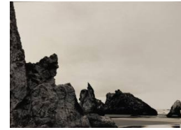
Title: Bandon Beach, Oregon | Hexagram #20 - Kuan /Contemplation (View) (From the series "Images In The Heavens, Patterns On The Earth; The I Ching") Date: 1989 Primary Maker: David Scheinbaum Medium: a.) gelatin silver print with b.) printed text panel