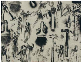
Title: Tools in the Earth Date: 2007 Primary Maker: Jim Dine Medium: two color, six plate lithograph