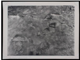
Title: River, Mt. Princeton, Colorado | Hexagram #60 - CHIEH /Limitation, (from the series Images In The Heavens, Patterns On The Earth; The I Ching) Date: 1994 (printed 2004) Primary Maker: Janet Russek Medium: gelatin silver print with printed text panel