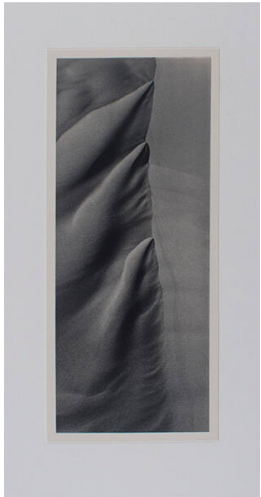
Title: Death Valley Sand Dunes, IV, Nevada | Hexagram #42 - Increase (from the series Images In The Heavens, Patterns On The Earth; The I Ching) Date: 1999 (printed 2006) Primary Maker: David Scheinbaum Medium: a.) gelatin silver print with b.) printed text panel