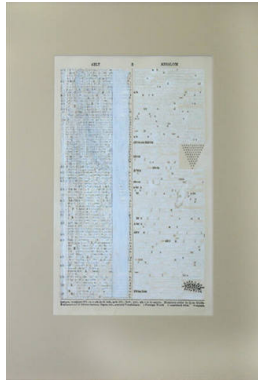
Title: Abracadabra (Version II) Date: February 1981 Primary Maker: Doris Cross Medium: painted photostat