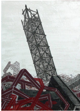
Title: Monument VII Date: 2003 Primary Maker: Nicola López Medium: Ten-color lithograph with collaged, hand-cut, printed elements