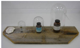
Title: Extracted from the Laboratory Action "Universal Gum and Tradecake" Date: 2000 Primary Maker: Thomas Ashcraft Medium: Mixed media