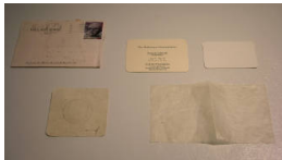
Title: CUE Foundation Invitation Date: December 2004 - January 2005 Primary Maker: Thomas Ashcraft Medium: Mixed media