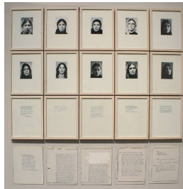
Title: The Face My Mother Gave Me Date: 1914 Primary Maker: Nancy Kitchel Medium: Black and white photos framed in grid