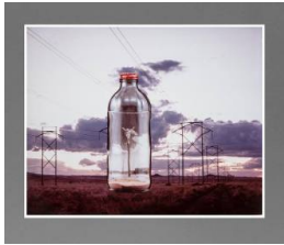
Title: Glass Jar with Crucifix - Station of the Cross #10: Jesus Stripped Date: circa 1995 Primary Maker: Delilah Montoya Medium: chromogenic print with mixed media