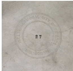
Title: Interdimensional City of Friends, #27 Date: n.d. Primary Maker: Thomas Ashcraft Medium: Embossed and rubber-stamped on Nepalese lokta paper