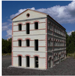
Title: Flour Factory Date: 2008 Primary Maker: Martí Anson Medium: bricks, cement and wood