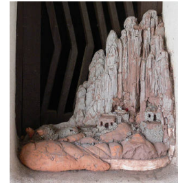
Title: Dwelling for Imaginary Civilization of Little People Date: 1998 Primary Maker: Charles Simonds Medium: Clay, adobe and paint