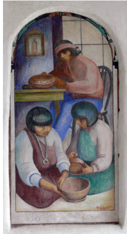
Title: Pottery Maker Date: 1934 Primary Maker: Will Shuster Medium: fresco