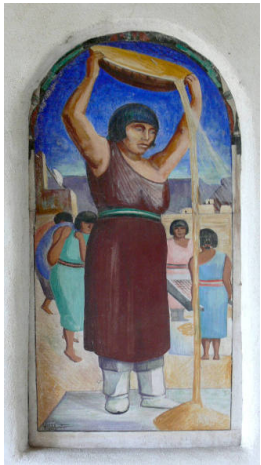
Title: Winnowing Wheat Date: 1934 Primary Maker: Will Shuster Medium: fresco