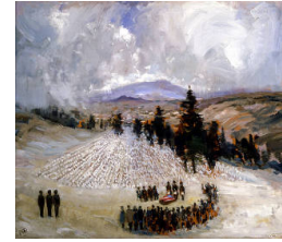
Title: Adios Amigo - Hasta la Vista Date: 1969 Primary Maker: Fremont F. Ellis Medium: oil on canvas