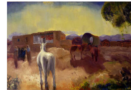
Title: Chimayo Date: 1917 Primary Maker: George W. Bellows Medium: oil on canvas