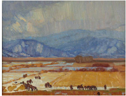
Title: Untitled Date: n.d. Primary Maker: Ernest L. Blumenschein Medium: oil on canvas