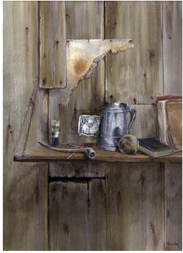
Title: Untitled Date: 1986 Primary Maker: Chuck Dailey Medium: acrylic on board