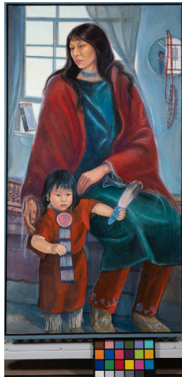
Title: Native Daughter (Self-portrait) Date: 1987 Primary Maker: Charlene Teters Medium: oil on canvas