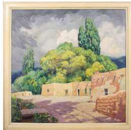
Title: The Coming Storm Date: n.d. Primary Maker: Sheldon Parsons Medium: oil on canvas