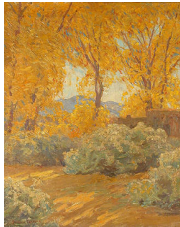
Title: The Golden Screen Date: 1916 Primary Maker: Sheldon Parsons Medium: oil on canvas