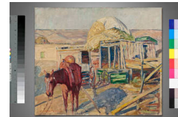
Title: New Mexico Landscape Date: n.d. Primary Maker: Sheldon Parsons Medium: oil on panel