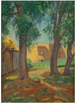
Title: Hacienda Date: n.d. Primary Maker: Sheldon Parsons Medium: Oil on paperboard