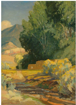
Title: Santa Fe River Date: before 1943 Primary Maker: Sheldon Parsons Medium: oil on paperboard