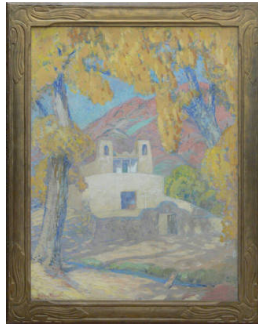
Title: Santuario Date: 1918 Primary Maker: Sheldon Parsons Medium: Oil on wallboard panel