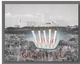
Title: Gang Bang at the WIPP Site [from the series Nuclear Waste (d)] Date: 1989 Primary Maker: Judy Chicago Medium: sprayed acrylic, oil and photography on photolinen