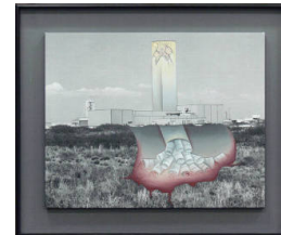
Title: Eureka, or What's a Mother For? [from the series Nuclear Waste(d)] Date: 1989 Primary Maker: Judy Chicago Medium: sprayed acrylic, oil and photography on photolinen