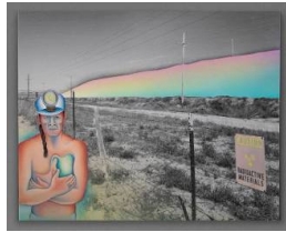
Title: Grants, New Mexico [from the series Nuclear Waste(d)] Date: 1989 Primary Maker: Judy Chicago Medium: sprayed acrylic, oil and photography on photolinen