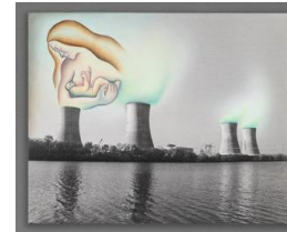
Title: Poisoned Power [from the series Nuclear Waste(d)] Date: 1989 Primary Maker: Judy Chicago Medium: sprayed acrylic, oil and photography on photolinen