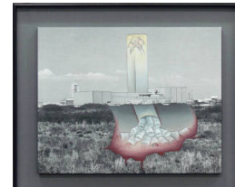
Title: Eureka, or What's a Mother For? [from the series Nuclear Waste(d)] Date: 1989 Primary Maker: Judy Chicago Medium: sprayed acrylic, oil and photography on photolinen