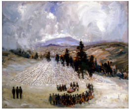
Title: Adios Amigo - Hasta la Vista Date: 1969 Primary Maker: Fremont F. Ellis Medium: oil on canvas