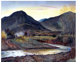
Title: Rio Hondo Date: 1940-1941 Primary Maker: Peter Hurd Medium: egg tempera on gesso on wood panel