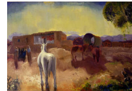
Title: Chimayo Date: 1917 Primary Maker: George W. Bellows Medium: oil on canvas