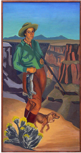
Title: The Huntress, A Self-Portrait