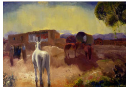
Title: Chimayo Date: 1917 Primary Maker: George W. Bellows Medium: oil on canvas