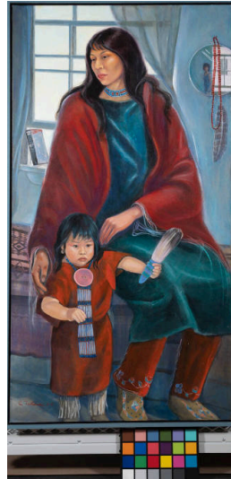
Title: Native Daughter (Self-portrait)