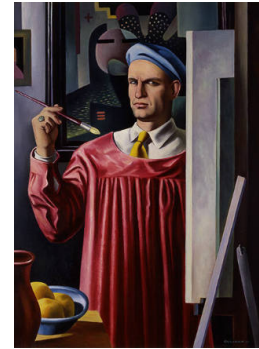
Title: Self-Portrait Date: 1935 Primary Maker: Emil Bisttram Medium: oil on canvas