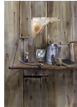
Title: Untitled Date: 1986 Primary Maker: Chuck Dailey Medium: acrylic on board