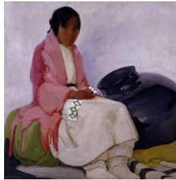
Title: The Beadworker Date: n.d. Primary Maker: Victor Higgins Medium: oil on board