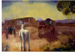
Title: Chimayo Date: 1917 Primary Maker: George W. Bellows Medium: oil on canvas