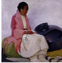
Title: The Beadworker Date: n.d. Primary Maker: Victor Higgins Medium: oil on board