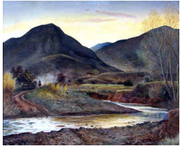
Title: Rio Hondo Date: 1940-1941 Primary Maker: Peter Hurd Medium: egg tempera on gesso on wood panel