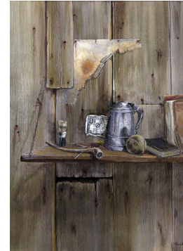
Title: Untitled Date: 1986 Primary Maker: Chuck Dailey Medium: acrylic on board