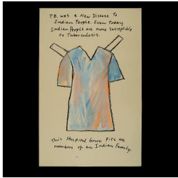
Title: T.B. Was A New Disease To Indian People. Even Today Indian People Are More Susceptible To Tuberculosis. This Hospital Gown Fits All Members of An Indian Family (from the series Paper Dolls for a Post Columbian World) Date: 1991 Primary Maker: Jaune Quick-To-See Smith Medium: xerographic print with watercolor and pencil