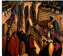
Title: Dance at Taos Date: 1923 Primary Maker: Ernest L. Blumenschein Medium: oil on canvas