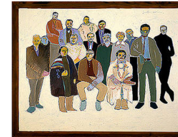
Title: Arts Faculty at the Institute of American Indian Arts at 4:15pm Date: 1968 Primary Maker: Fritz Scholder Medium: oil on canvas