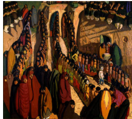
Title: Dance at Taos Date: 1923 Primary Maker: Ernest L. Blumenschein Medium: oil on canvas