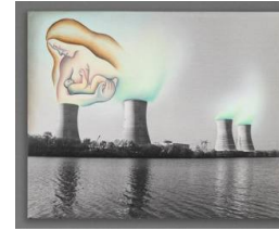
Title: Poisoned Power [from the series Nuclear Waste(d)] Date: 1989 Primary Maker: Judy Chicago Medium: sprayed acrylic, oil and photography on photolinen