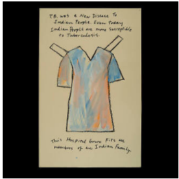
Title: T.B. Was A New Disease To Indian People. Even Today Indian People Are More Susceptible To Tuberculosis. This Hospital Gown Fits All Members of An Indian Family (from the series Paper Dolls for a Post Columbian World) Date: 1991 Primary Maker: Jaune Quick-To-See Smith Medium: xerographic print with watercolor and pencil