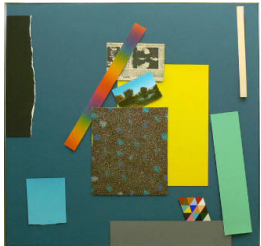
Title: #9 with O'Keeffe Date: 1981 Primary Maker: Paul Sarkisian Medium: Acrylic and mixed media on canvas