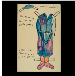
Title: Maid's Uniform For Cleaning Houses of White People After Good Education at Jesuit School (from the series Paper Dolls for a Post Columbian World) Date: 1991 Primary Maker: Jaune Quick-To-See Smith Medium: xerographic print, with watercolor and pencil