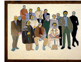
Title: Arts Faculty at the Institute of American Indian Arts at 4:15pm Date: 1968 Primary Maker: Fritz Scholder Medium: oil on canvas