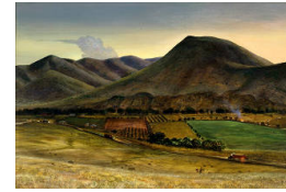
Title: Highway at Dusk Date: 1955 Primary Maker: Peter Hurd Medium: egg tempera on gesso on Masonite panel