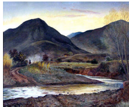
Title: Rio Hondo Date: 1940-1941 Primary Maker: Peter Hurd Medium: egg tempera on gesso on wood panel