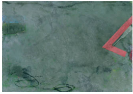
Title: Steinweg and Peterman Date: 1973 Primary Maker: Peter Plagens Medium: collage painting with gouache, oil and crayon