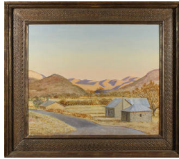
Title: Our Valley in Autumn Date: late 1960s Primary Maker: Peter Hurd Medium: Tempera on board