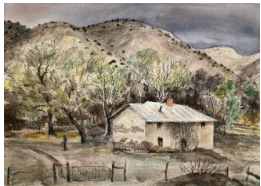
Title: Bringing in the Horses (Casa de Viejito) Date: c. 1955 Primary Maker: Peter Hurd Medium: Watercolor on paper, matted and framed under glass