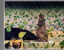
Title: Trinitite, Ground Zero, Trinity Site, New Mexico (from the series Nuclear Enchantment) Date: 1988-89 Primary Maker: Patrick Nagatani Medium: silver-dye bleach print