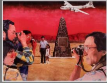
Title: Trinity Site, Jornada Del Muerto, New Mexico (from the series Nuclear Enchantment) Date: 1989 Primary Maker: Patrick Nagatani Medium: silver-dye bleach print