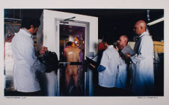
Title: Esoteric Science - Sandia National Laboratory, New Mexico 2004 (from the series Chromatherapy) Date: 2004 Primary Maker: Patrick Nagatani Medium: chromogenic print