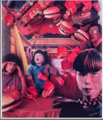
Title: Radioactive Reds (from the series Polaroid Collaborations) Date: 1986 Primary Maker: Patrick Nagatani Medium: silver-dye bleach print