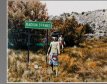
Title: Radium Springs, New Mexico (from the series Nuclear Enchantment) Date: 1989 Primary Maker: Patrick Nagatani Medium: silver-dye bleach print