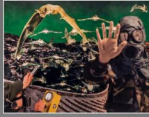
Title: "Fin de Siècle" Bat Flight Amphitheater, Carlsbad Caverns, New Mexico (from the series Nuclear Enchantment) Date: 1989 Primary Maker: Patrick Nagatani Medium: silver-dye bleach print