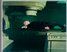
Title: Radiation Therapy Room, Albuquerque, New Mexico, (from the series Nuclear Enchantment) Date: 1989 Primary Maker: Patrick Nagatani Medium: silver-dye bleach print