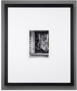
Title: Political Poster, Massachusetts Village Date: 1929 (printed 1971) Primary Maker: Walker Evans Medium: gelatin silver print