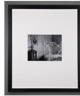
Title: Bed and Stove, Truro, Mass. Date: 1931 (printed 1971) Primary Maker: Walker Evans Medium: gelatin silver print