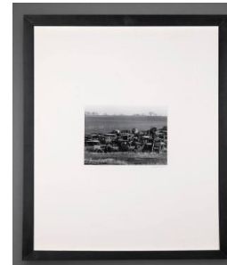
Title: Joe's Auto Graveyard, Pennsylvania Date: 1935 (printed 1971) Primary Maker: Walker Evans Medium: gelatin silver print