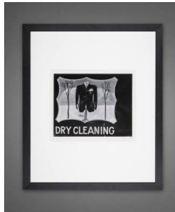
Title: Roadside Sign, Louisiana (from the portfolio Walker Evans: 14 Photographs) Date: 1936 (printed 1971) Primary Maker: Walker Evans Medium: gelatin silver print