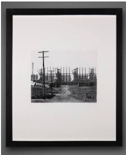
Title: Bessemer, Alabama Date: 1936 (printed 1971) Primary Maker: Walker Evans Medium: gelatin silver print