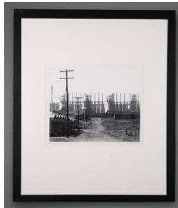
Title: Bessemer, Alabama Date: 1936 (printed 1971) Primary Maker: Walker Evans Medium: gelatin silver print