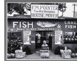
Title: Roadside Stand Near Birmingham, Alabama (from Walker Evans, 14 Photographs, 1971) Date: 1936 (printed 1971) Primary Maker: Walker Evans Medium: gelatin silver print