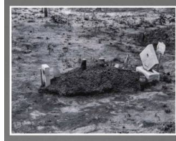
Title: Grave, Hale County, Alabama (from Walker Evans, 14 Photographs, 1971) Date: 1936 (printed 1971) Primary Maker: Walker Evans Medium: gelatin silver print