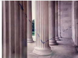
Title: Blue Right Angle, Albright Knox Gallery, Buffalo, New York (from the series Altered Landscapes ) Date: 1975 printed 1977 Primary Maker: John Pfahl Medium: Chromogenic print