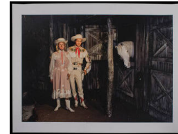
Title: Wax Roy and Dale, Orlando, Florida Date: 1981, (printed later) Primary Maker: Nathan Benn Medium: pigment print