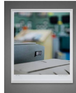
Title: Detail XII Date: 2012 Primary Maker: Thomas Demand Medium: pigment print