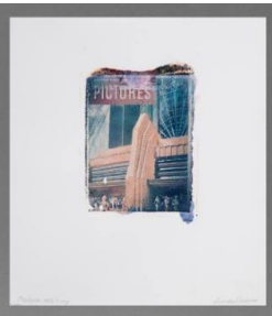
Title: Pictures Date: 2002 Primary Maker: Thomas Barrow Medium: Polaroid transfer