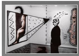
Title: Untitled (Selective Tones) Date: 1983 Primary Maker: Karl Baden Medium: split-toned gelatin silver print, from negative with applied cliché-verre