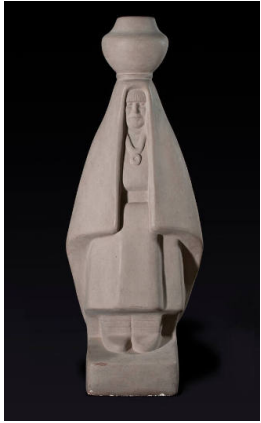
Title: Untitled (Native American Woman) Date: 1954 Primary Maker: Eugenie F. Shonnard Medium: molded plaster with slip