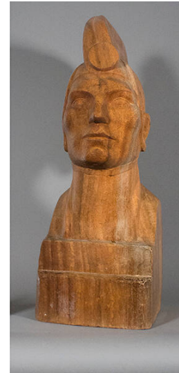
Title: Untitled Date: mid 20th Century Primary Maker: Eugenie F. Shonnard Medium: mahogany