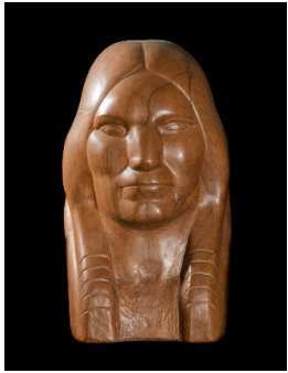
Title: Untitled (Bust of Native American Male) Date: mid 20th Century Primary Maker: Eugenie F. Shonnard Medium: mahogany