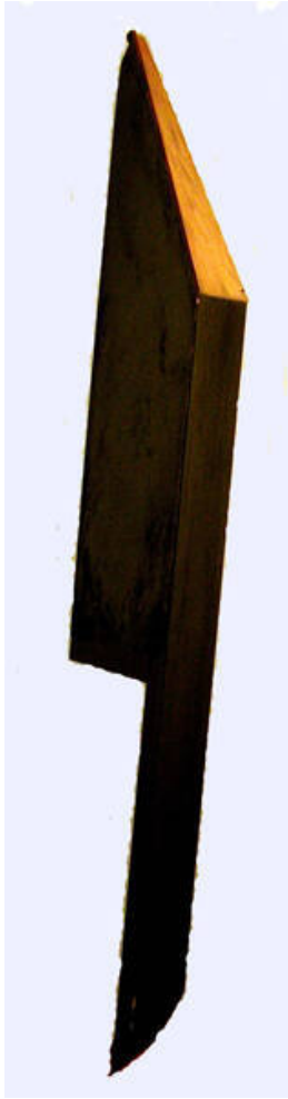
Title: Untitled Date: circa 1992 Primary Maker: Constance DeJong Medium: wood, copper