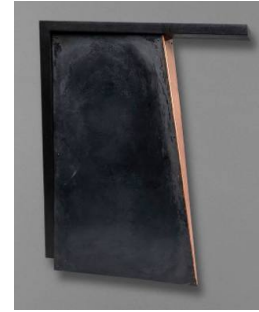
Title: Section 2 (formerly Cradle II) Date: 1991 Primary Maker: Constance DeJong Medium: copper and wood