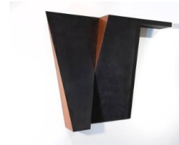
Title: Triune Date: 1988 Primary Maker: Constance DeJong Medium: Copper, wood, paint.