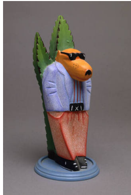
Title: Untitled (Coyote) Date: n.d. Medium: wood, paint