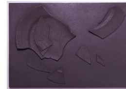
Title: Japanese Plate Date: 1977-1978 Medium: painted aluminum