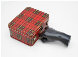
Title: Square Meal Date: 2001/2021 Medium: Bronze and found material