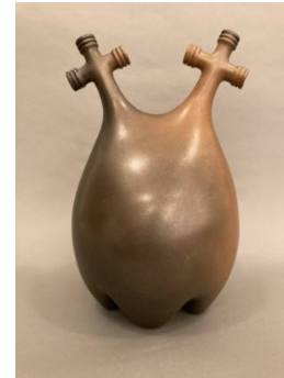
Title: LDS-MHB-DCMR-1219E-01 Date: 2019 Medium: pit-fired foraged clay