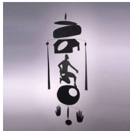
Title: Circlings 5 Date: 2010 Primary Maker: Ivan Barnett Medium: pigmented steel