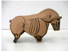
Title: Bull (42) Date: 1954 Medium: terra cotta (ceramic)