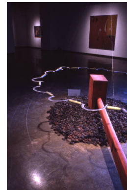
Title: Sacred Work Date: 1996 Primary Maker: Florencio Gelabert Medium: wood, steel, volcanic rock