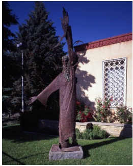
Title: Elijah Date: 1970-1972 Medium: Iron