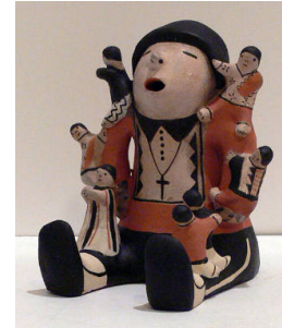
Title: Male Storyteller Date: circa 1980 Primary Maker: Helen Cordero Medium: polychrome painted ceramic