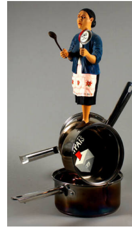
Title: La Revolución de los Sartenes Date: 2007 Primary Maker: Sergio Tapia Medium: carved and painted wood and stainless steel pans