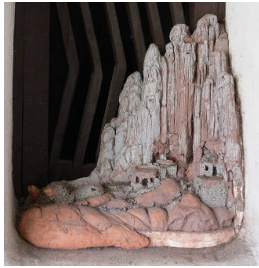
Title: Dwelling for Imaginary Civilization of Little People Date: 1998 Primary Maker: Charles Simonds Medium: Clay, adobe and paint