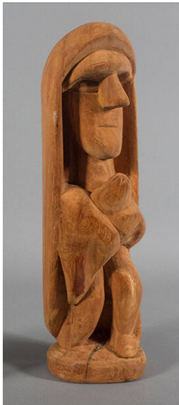
Title: Untitled Date: circa 1940 Primary Maker: Patrocinio Barela Medium: cedar