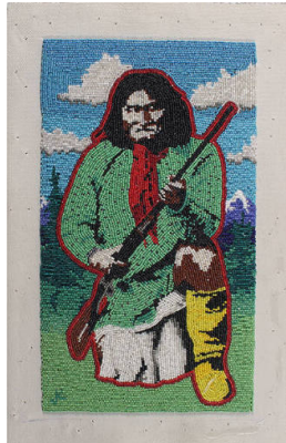
Title: Untitled (Geronimo/Goyathlay) Date: 20th Century Primary Maker: Joseph Kahze Medium: beadwork on canvas