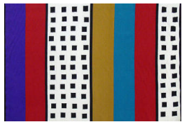
Title: Katsina 6 Date: 1989 Primary Maker: Ramona Sakiestewa Medium: wool