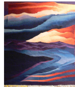
Title: Blue Cloud (from the Ghost Rug series) Date: 1984 Primary Maker: Janusz Kozikowski Medium: wool with cibachrome dyes