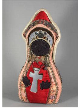
Title: Santera Black Madonna Date: 1992 Primary Maker: Helenn Rumpel Medium: rayon, brocade, velvet and gold kid