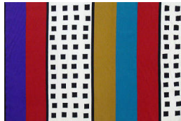
Title: Katsina 6 Date: 1989 Primary Maker: Ramona Sakiestewa Medium: wool