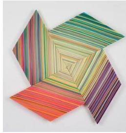
Title: Deafened by Pinwheel