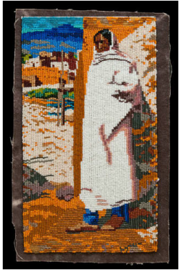
Title: Back to the Blanket

Medium: tufted and sheared wool pile, acid dyes and cotton backing