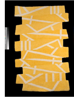
Title: Arroyo Seco #3