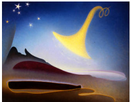
Title: Awakening Date: 1943 Primary Maker: Agnes Pelton Medium: oil on canvas