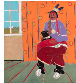
Title: Washington Landscape with Peace Medal Indian Date: 1976 Primary Maker: T. C. Cannon Medium: acrylic on canvas