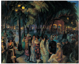
Title: Music in the Plaza Date: 1920 Primary Maker: John Sloan Medium: oil on canvas