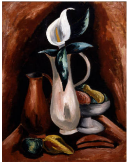
Title: Still Life Date: 1922 Primary Maker: Marsden Hartley Medium: oil on canvas