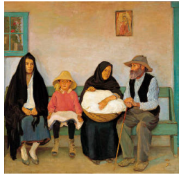
Title: Our Washerwoman's Family - New Mexico Date: circa 1918 Primary Maker: Bert Geer Phillips Medium: oil on canvas