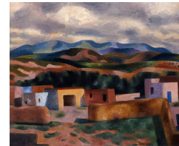
Title: My Gate on the Camino Date: 1928 Primary Maker: Andrew Dasburg Medium: oil on panel