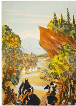
Title: Daybreak at Powder River Date: 1980 Primary Maker: Earl Biss Medium: lithograph