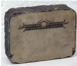
Title: No title (lithographic stone with letterhead from Merchants' and Manufacturers' Mutual Insurance Company) Date: n.d. Primary Maker: Unknown Maker Medium: limestone