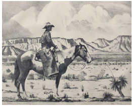
Title: Cow Country Date: 1950 Primary Maker: Theodore Van Soelen Medium: lithograph