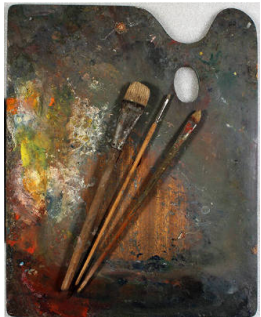
Title: No title (palette) Date: n.d. Primary Maker: Edgar Britton Medium: wood and pigment