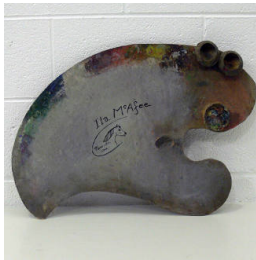
Title: No title (palette) Date: 1986 Primary Maker: Ila McAfee Medium: wood and pigment