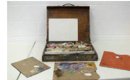
Title: No title (artist's paint box) Date: circa 1911 Primary Maker: Fremont F. Ellis Medium: mixed media