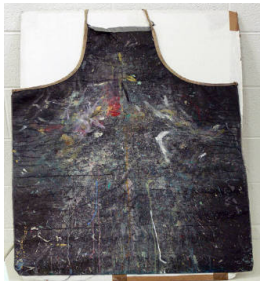
Title: No title (shop apron) Date: circa 1998 Primary Maker: Tom Leech Medium: cotton and paint