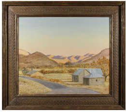
Title: Our Valley in Autumn Date: late 1960s Primary Maker: Peter Hurd Medium: Tempera on board