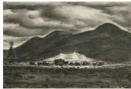
Title: The Little Circus Date: n.d. Primary Maker: Peter Hurd Medium: Ink on paper