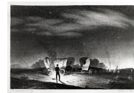
Title: The Santa Fe Trail Date: circa 1946 Primary Maker: Peter Hurd Medium: lithograph