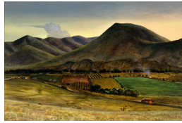
Title: Highway at Dusk Date: 1955 Primary Maker: Peter Hurd Medium: egg tempera on gesso on Masonite panel