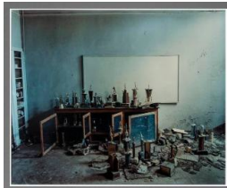
Title: Trophies in an abandoned school in Bula, Texas, October 24, 2004 Date: 2004 Medium: Chromogenic print (Fuji Crystal Archive paper)