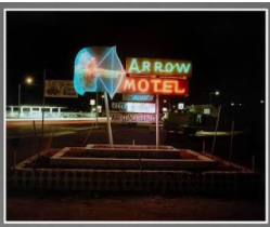
Title: Arrow Motel, Highway 84, Espanola, New Mexico, March 23, 1982 Date: Negative 1982, print 2021 Primary Maker: Steve Fitch Medium: pigment print