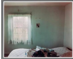
Title: Bedroom in a house near Scranton, North Dakota, June 9, 2000 Date: 2000 Primary Maker: Steve Fitch Medium: Chromogenic print (Fuji Crystal Archive paper)