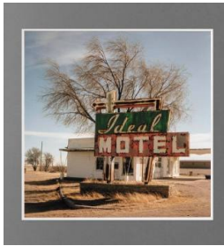
Title: Highway 54, 60 and 285, Vaughn, New Mexico, January, 1994 (from the series Western Landmarks) Date: January 1994 (printed 2011) Primary Maker: Steve Fitch Medium: pigment print