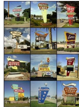
Title: Motel signs, 1979 to 2005 Date: Conceived in 2009 from negatives from 1979 through 2005, print 2021 Primary Maker: Steve Fitch Medium: pigment print