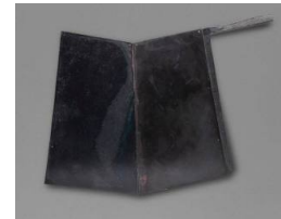
Title: Edjos Plow Date: 1987 Primary Maker: Constance DeJong Medium: copper on wood