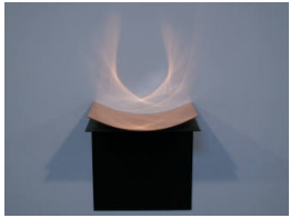
Title: arc/r44 Date: 2005 Primary Maker: Constance DeJong Medium: Copper and lacquered maple