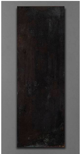
Title: Nitrate Painting XV Date: 1996 Primary Maker: Constance DeJong Medium: chemical patination on copper