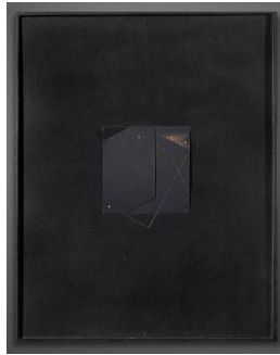
Title: Three Point Seven Five Date: 1987 Primary Maker: Constance DeJong Medium: copper on Masonite