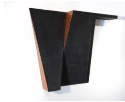
Title: Triune Date: 1988 Primary Maker: Constance DeJong Medium: Copper, wood, paint.