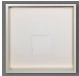
Title: Untitled Date: 2005 Primary Maker: Constance DeJong Medium: copper and paper