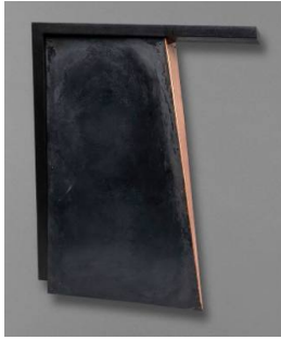
Title: Section 2 (formerly Cradle II) Date: 1991 Primary Maker: Constance DeJong Medium: copper and wood