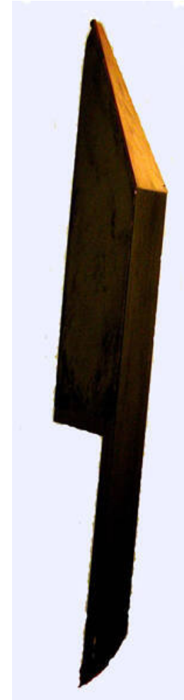
Title: Untitled Date: circa 1992 Primary Maker: Constance DeJong Medium: wood, copper