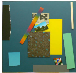
Title: #9 with O'Keeffe Date: 1981 Primary Maker: Paul Sarkisian Medium: Acrylic and mixed media on canvas