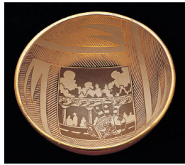
Title: Double Take Date: 2002 Primary Maker: Diego Romero Medium: gold gilt, paint and clay