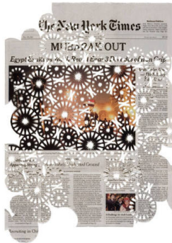
Title: 2.12.11 Date: 2011 Primary Maker: Donna Ruff Medium: hand-cut newspaper