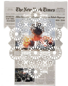
Title: 3.21.11 Date: 2011 Primary Maker: Donna Ruff Medium: hand-cut newspaper