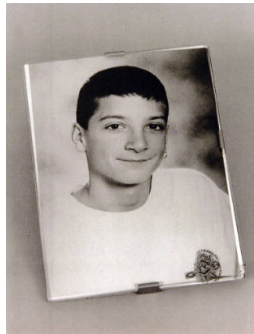
Title: Favorite Objects: Portrait Date: 1998 Primary Maker: Christian Boltanski Medium: Digital photograph