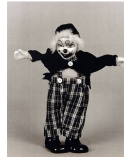
Title: Favorite Objects: Clown Date: 1998 Primary Maker: Christian Boltanski Medium: Digital photograph