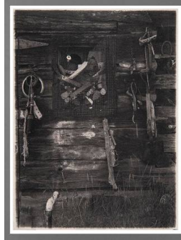
Title: Assemblage of Objects on Wall, North Shore, Lake Superior, MA Date: 1962 Primary Maker: Wayne R. Lazorik Medium: platinum