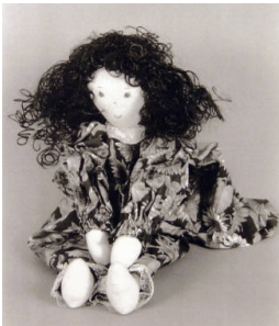
Title: Favorite Objects: Doll Date: 1998 Primary Maker: Christian Boltanski Medium: Digital photograph