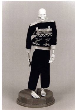
Title: Favorite Objects: Figure Date: 1998 Primary Maker: Christian Boltanski Medium: Digital photograph