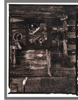
Title: Assemblage of Objects on Wall, North Shore, Lake Superior, MA Date: 1962 Primary Maker: Wayne R. Lazorik Medium: carbo print