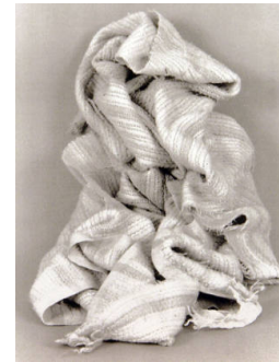
Title: Favorite Objects: Blanket Date: 1998 Primary Maker: Christian Boltanski Medium: Digital photograph