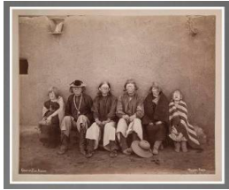
Title: Untitled (Group of Zuni people with albinism) Date: 1879 Primary Maker: John Karl Hillers Medium: Albumen print