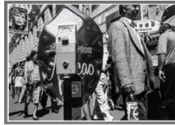
Title: Moscow (Parking Meter and Street Scene with People Passing) Date: 1996 Primary Maker: Igor Moukhin Medium: gelatin silver print