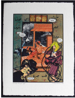
Title: Village People (from the series Heroicomic) Date: 1992 Primary Maker: Joyce Neimanas Medium: inkjet print