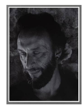
Title: Joel Peter Witkin, Rockport, Maine Date: 1988, printed circa