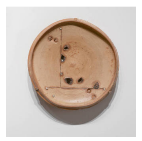
Title: Untitled (Set of 14 Plates) Date: 1978 Primary Maker: Peter