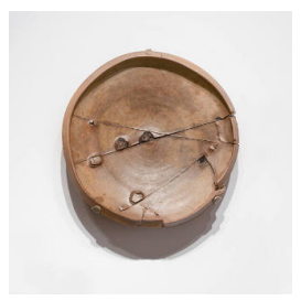
Title: Untitled (Set of 14 Plates) Date: 1978 Primary Maker: Peter