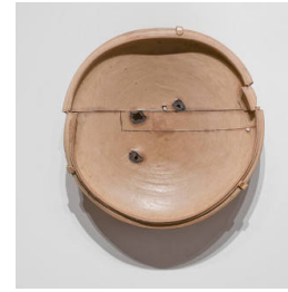
Title: Untitled (Set of 14 Plates) Date: 1978 Primary Maker: Peter Voulkos Medium: stoneware