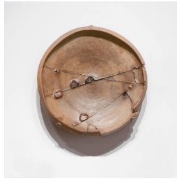
Title: Untitled (Set of 14 Plates) Date: 1978 Primary Maker: Peter Voulkos Medium: stoneware