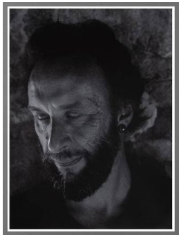
Title: Joel Peter Witkin, Rockport, Maine Date: 1988, printed circa 1995 Primary Maker: Arnold Newman Medium: gelatin silver print