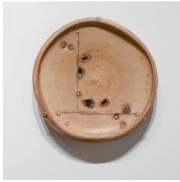
Title: Untitled (Set of 14 Plates) Date: 1978 Primary Maker: Peter Voulkos Medium: stoneware