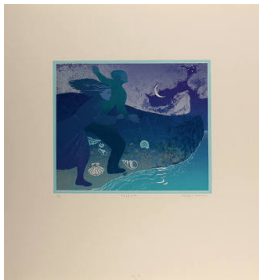
Title: Flight (from the portfolio The Quest) Date: n.d. Primary Maker: Kate Krasin Medium: silk screen print by Kate Krasin based on drawings by Peter Rogers