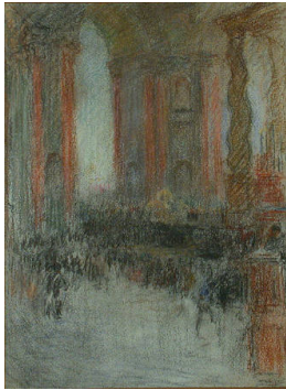
Title: Coronation Pope Pius: St. Peters, Rome Date: circa 1903 Primary Maker: William Penhallow Henderson Medium: pastel on paper