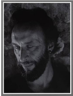
Title: Joel Peter Witkin, Rockport, Maine Date: 1988, printed circa 1995 Primary Maker: Arnold Newman Medium: gelatin silver print