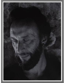
Title: Joel Peter Witkin, Rockport, Maine Date: 1988, printed circa 1995 Primary Maker: Arnold Newman Medium: gelatin silver print