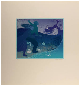
Title: Flight (from the portfolio The Quest) Date: n.d. Primary Maker: Kate Krasin Medium: silk screen print by Kate Krasin based on drawings by Peter Rogers