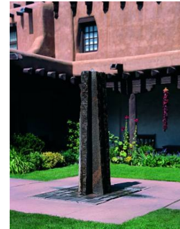
Title: Mountain Fountain Date: 1984 Primary Maker: Jesús Moroles Medium: Dakota granite