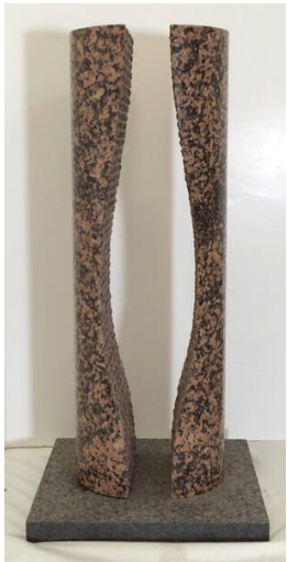
Title: Untitled Date: n.d. Primary Maker: Jesús Moroles Medium: Texas pink granite