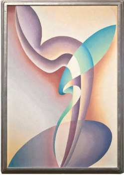
Title: Composition No. 57 Date: 1939 Primary Maker: Stuart Walker Medium: oil on canvas