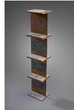
Title: Beam Ends Date: 1970 Primary Maker: Carl Andre Medium: Steel I-Beam